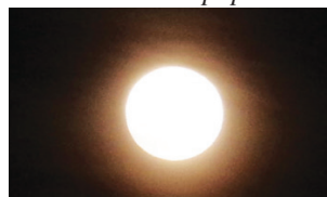
Worm, Crow or Sap Moon is the first of three straight full moon supermoons.

The education and safety of our students remains our number one priority.