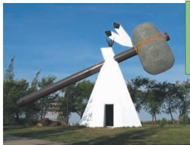
Home of the World's Largest Tomahawk

PLEASE CHECK YOUR LABEL Local $34, Canada $42 E-mail sub: $30 Canada & US Contact us: Cut Knife Courier 200 Steele Street, P.O. Box 119 Cut Knife, Saskatchewan S0M 0N0 Phone: (306) 398-3777 Fax: 398-3005 e-mail: ckcouriernews@sasktel.net